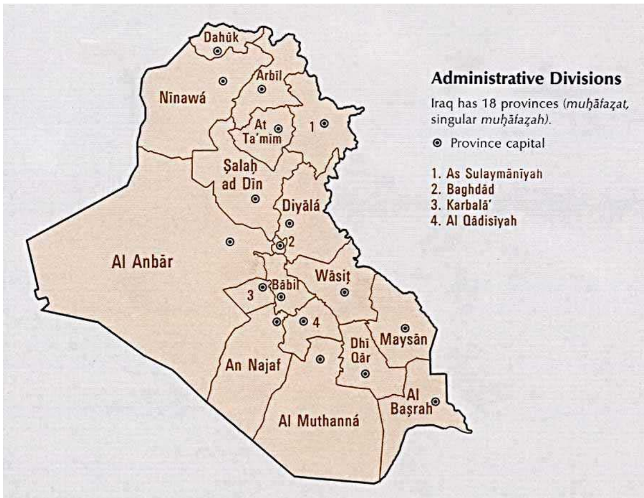
Figure 3: Central Intelligence Agency map provided by Iraq Research, 1993, available online at http://www.iraqresearch.com/html/map18.html .